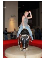
Brave guests took a turn on the mechanical bull.