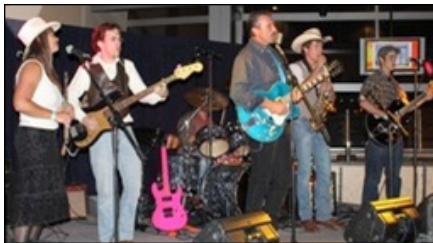
Blue Coyote keeps the dance floor packed all evening long!

The event raised approximately $100,000 for our youth and programs.