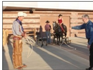
With calf roping and lasso lessons guests arrived in true western style.